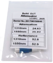
1, Single PE Bag

This easily taken and well-protected fiber optical cable package has been labelled and marked by OMC as default .Standard carton size : 34*22*15 cm; 44*34*24 cm ; 54*39*34 cm . Which carton to be used depends on goods Qty . Packing can be customized.