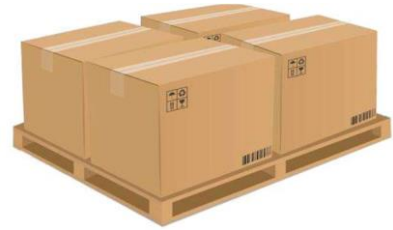
3, fumig-free Pallet