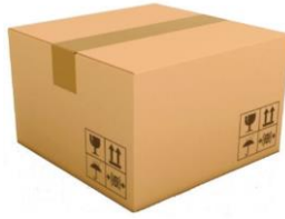
2, Paper Carton